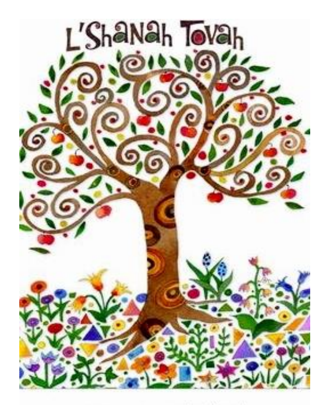
May your year be filled with health, happiness and peace.

Congregation Shaaray Tefila 68 Bay Street, Glens Falls, NY 12801 518.792.4945 (Office) 518.792.5966 (Fax) <u>www.shaaraytefila-gfny.org</u> <u>cstgfny@gmail.com</u>