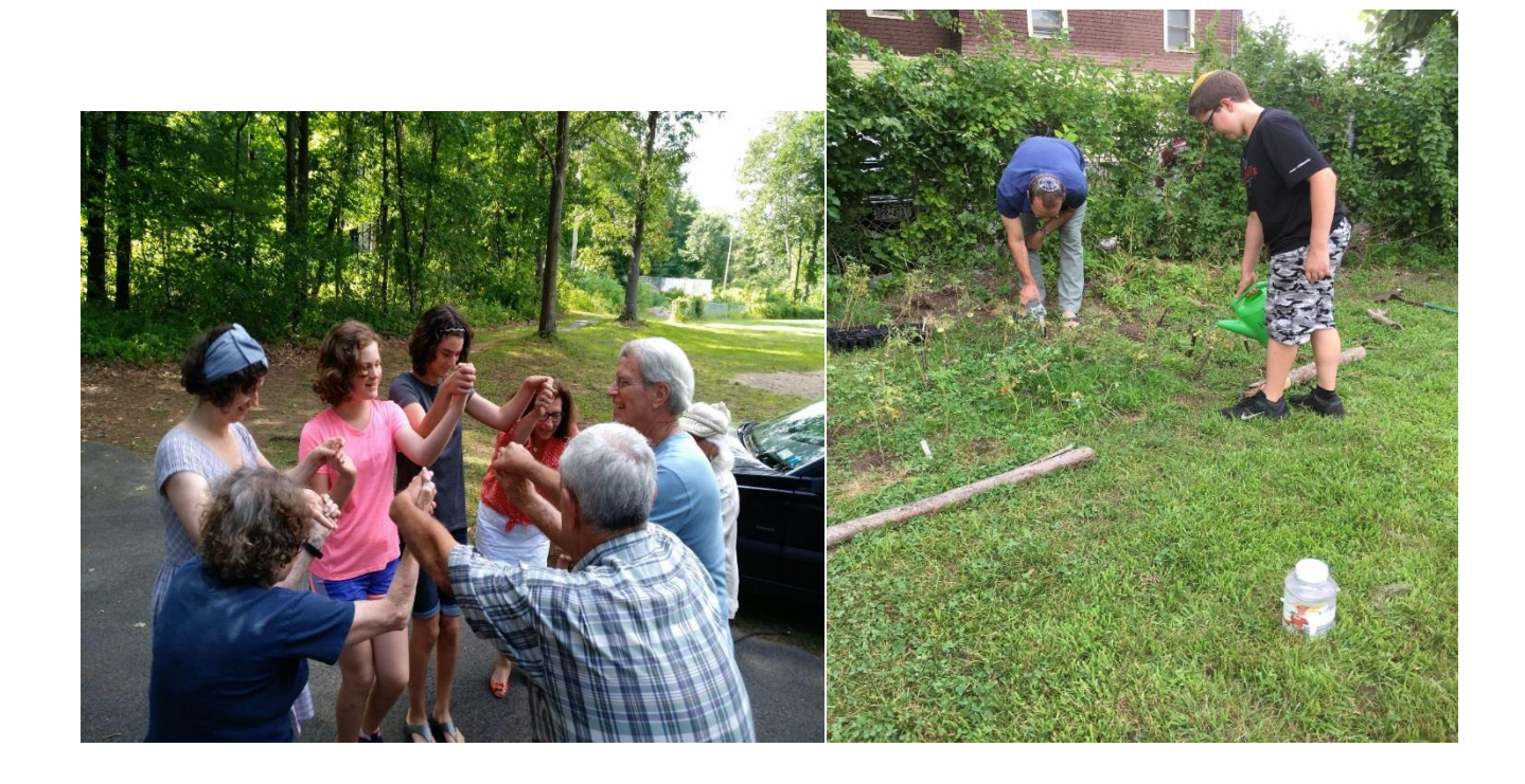
Planting Tomatoes in the garden